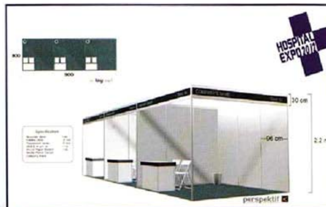
Exhibit cost includes: